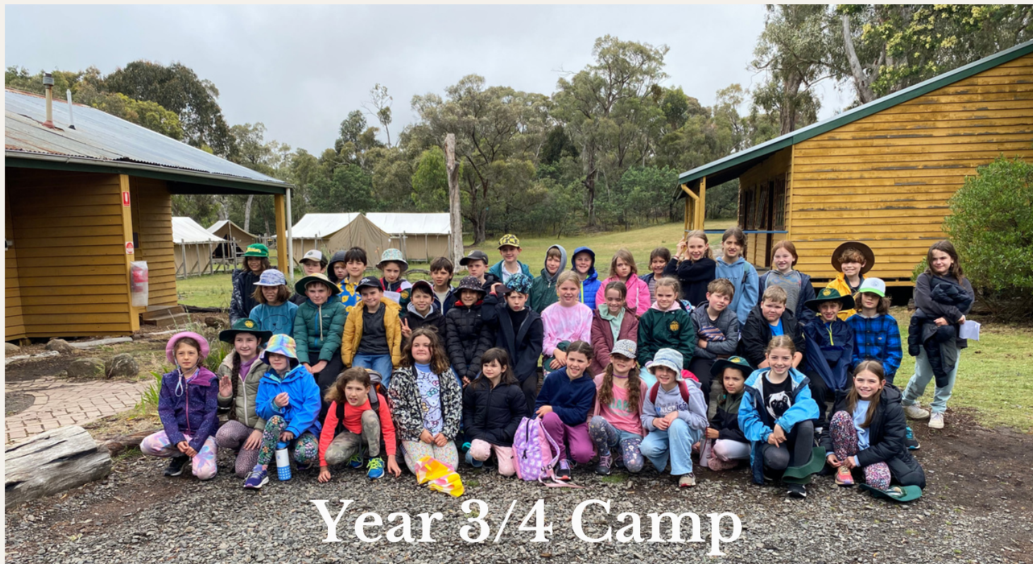
Year 3/4 Camp