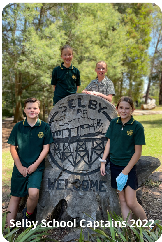
Selby School Captains 2022