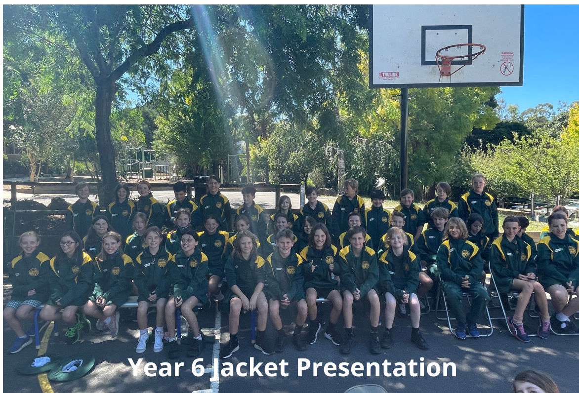
Year 6 Jacket Presentation

Respect Confidence Resilience Personal Best