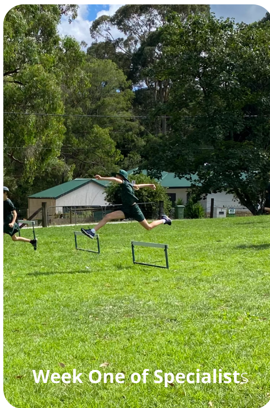
Week One of Specialists