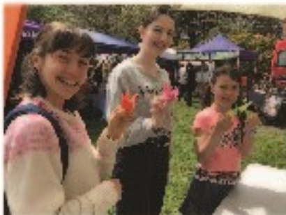
origami lesson $1

I will be selling my origami and would love you to come and have a look. Here are some things I sell. From April.