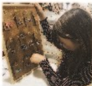
origami earrings $8