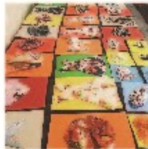
origami cards $2 or 3 for $5